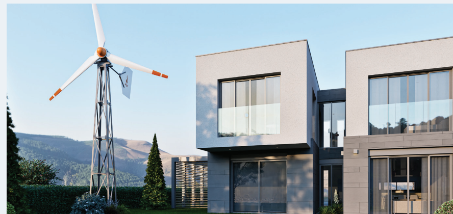
SoyutWind 5 kW Power Curve