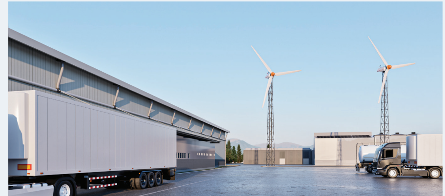
SoyutWind 50 kW Power Curve