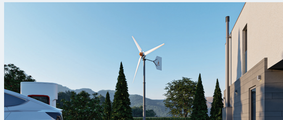
SoyutWind 3 kW Power Curve